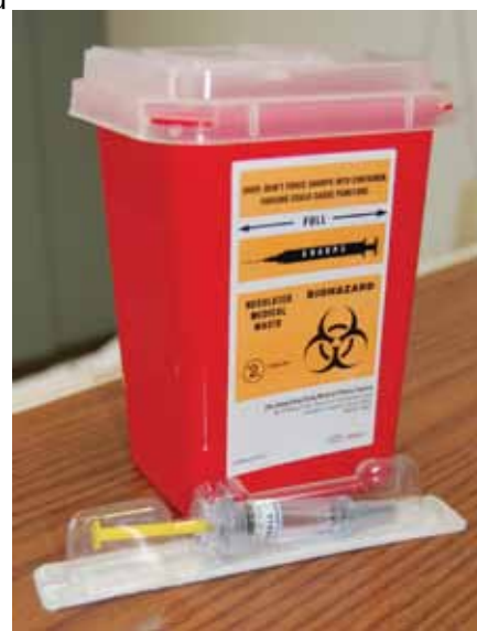
Disposable syringe and used needle container for Lovenox injections.

Medications will also be ordered to prevent clots. A medication called “Lovenox,” or a medication similar to this, may be given to you by injection using a very small needle so that it is well tolerated. You and/or your coach will receive instruction on the medication and will have you practice giving the medication while in the hospital.